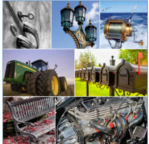
Delphi's K-Alloys are suitable for a wide variety of applications.

Engineered Materials: Coating, Corrosion Resistant Alternative